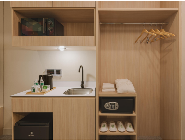
Hotel101 Showroom (Bathroom, Landscape)